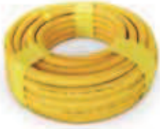
ESNEK METAL BORULAR