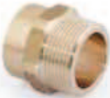
SAYAÇ ARA BAĞLANTI SOKETİ